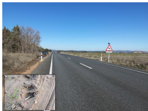
Start of TEFIVA marked by the P-24 sign and footprints found on the margins

In terms of training , a technical workshop for liquid scintillation users was held, attended by representatives of universities, technology centres and private companies that use this technique to guarantee the quality of their sustainable energy and chemical products, such as biofuels.