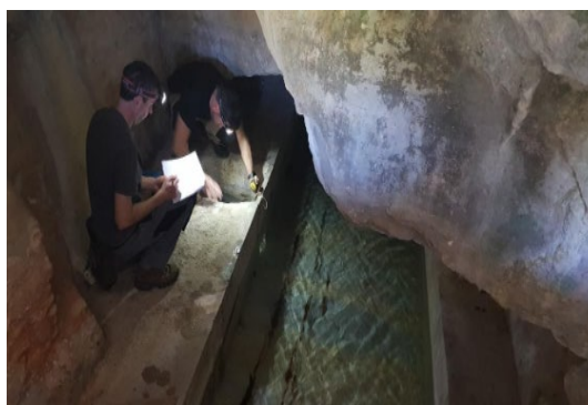
Monitoring and sampling of the Naixement de Bellús (spring that supplies Xàtiva) to verify that the water in the Bellús reservoir is not affected.

In addition, research work is applied to the study of the isotopic variability in the hydrological cycle. In this sense, we have participated in the final conference of the COST WATSON Action "Water isotopes in the critical zone: from groundwater recharge to plant transpiration", and we continue to deploy the Spanish Network of Isotope Monitoring in Precipitation (REVIP) in collaboration with other organizations such as the AEMET. These activities have been reflected, for example, in the participation in the XXIII Science and Innovation Week of the Community of Madrid with visits to the laboratory under the slogan "The isotopic composition of rainwater: from your umbrella to the tap at home".